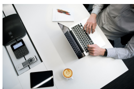
Operations & ERP