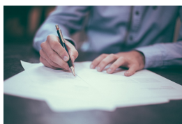
Business Income Tax Accountant